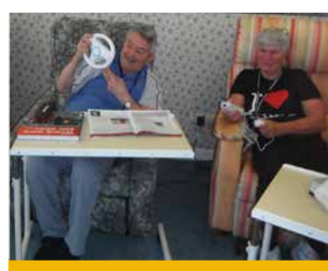
Residents at the Penola War Memorial Hospital enjoy activities on the new Nintendo Wii

The Millicent Men's Shed received $1000 to purchase tools and equipment for use in their newly created facilities. The Men's Shed forms part of the Millicent Community Hub, which includes the Art & Craft Centre, Community Garden, Lions/Lioness Club, Rotary Club, Shooting Starz Guide Unit, the Road Safety School and other community services.