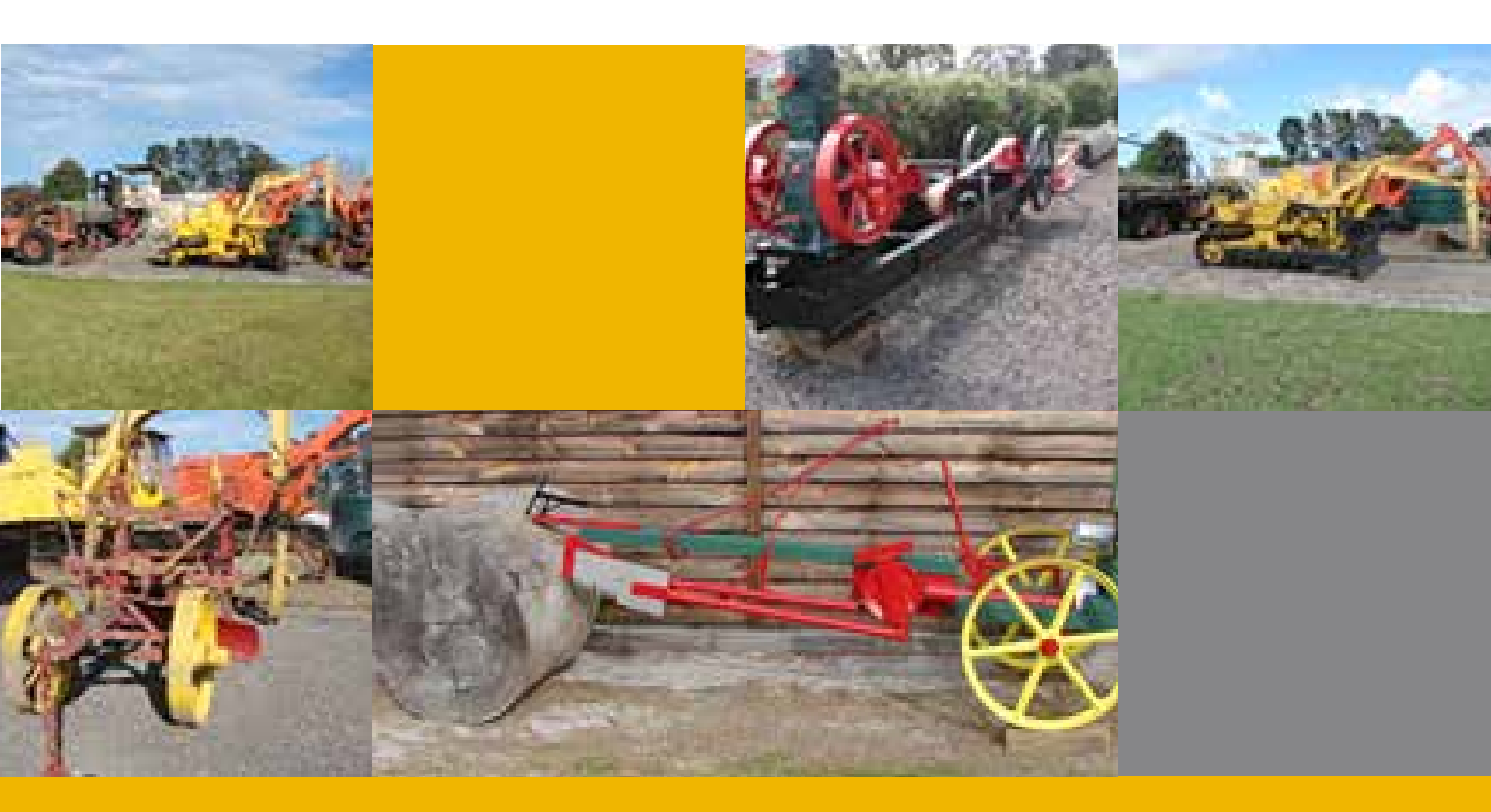
In Grant Round 12 Nangwarry Museum and Community Hall received funding to aid in the preservation of forestry equipment. The funds were used to repair, clean and repaint historical forestry equipment that would otherwise due to the extensive degradation of the items have been lost. The items are housed in and around the museum which collects and preserves machinery and equipment used in the timber industry - one of the significant industries in the Limestone Coast.

The Penola War Memorial Hospital via the Penola War Memorial Hospital Auxilliary received $1000 for The Pinchunga Residents" Digital Television Project. The project was needed as the exisiting televisions were not compatible with didgital technology. The grant helped to facilitate the purchase and installation of new televisions providing disadvantage residents with access to digital television.