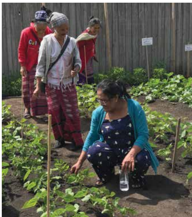
Limestone Coast Migrant Resource Centre Garden funded by the 2018 OneFortyOne Community Capacity Building Grants