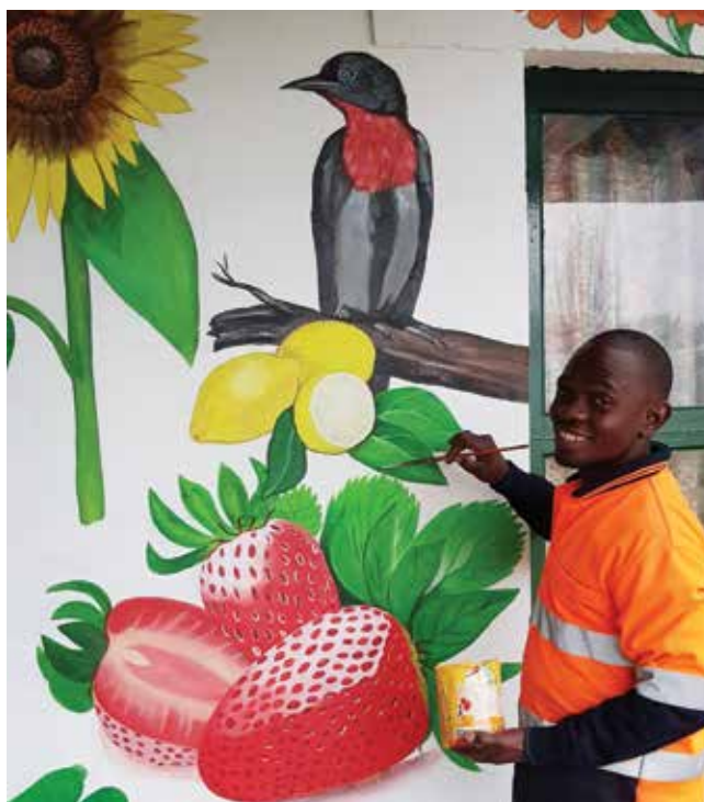
Limestone Coast Migrant Resource Centre Garden funded by the 2018 OneFortyOne Community Capacity Building Grants