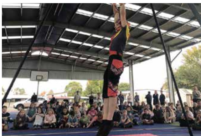
Children watch an acrobatics display at the Penola Coonawarra Arts Festival