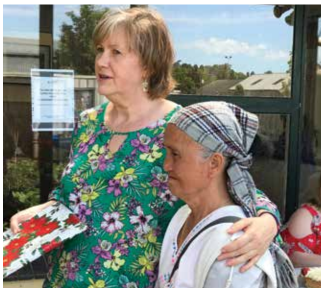
Limestone Coast Migrant Resource Centre Garden funded by the 2018 OneFortyOne Community Capacity Building Grants

$900 was offered to Sunset Community Kitchen to support their charitable operations in the region.