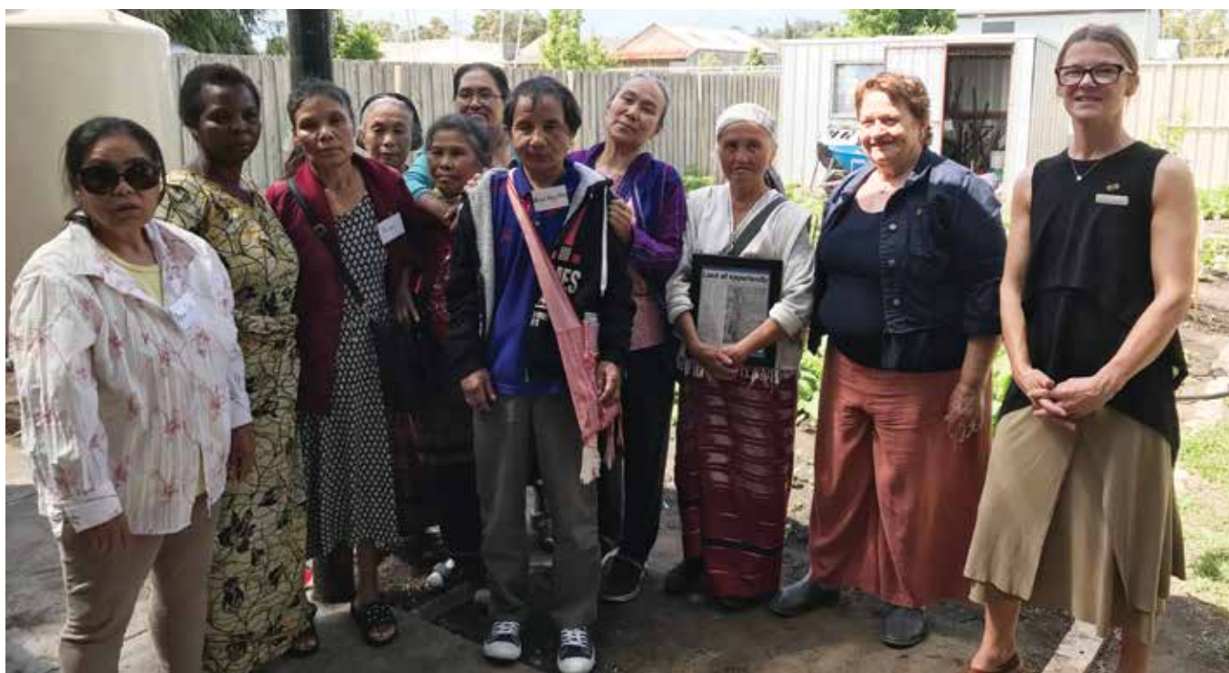
Limestone Coast Migrant Resource Centre Garden funded by the 2018 OneFortyOne Community Capacity Building Grants

$15,000 was provided to Carers Association of SA for their project “seeding a social enterprise incubator in the Limestone Coast”. Carers SA will host 3 workshops in the community with the aim that the workshops will seed the establishment of social enterprises (micro business) for carers and/or those with a disability. It is a train the trainer approach to enable the growth of social enterprises in the region.