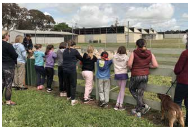
The children watching the dogs in the sheep yard