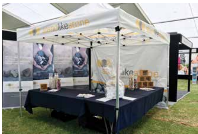
Stand Like Stone site at the South East Field Days

As part of our community relations strategy, Stand Like Stone attended the South East Field Days at Lucindale in March. The Field Days present a unique opportunity to mingle with people from the Limestone Coast and have conversations around the region, the Foundation and our activities. There were good levels of social media interaction over both days and as always the Field Days presented an outstanding opportunity for creating awareness of Stand Like Stone and our impact across the Limestone Coast.