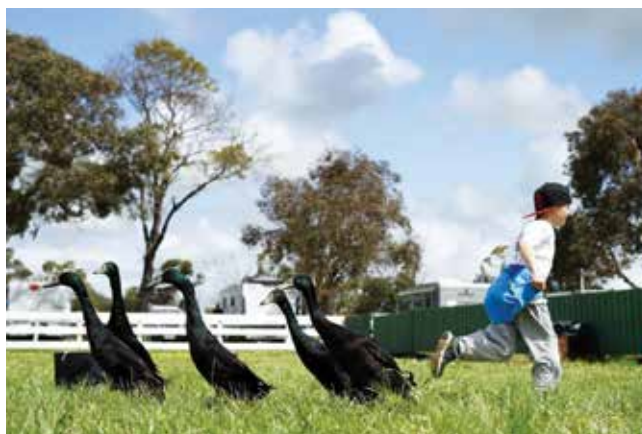
A young child tries to herd the Indian Runner Ducks